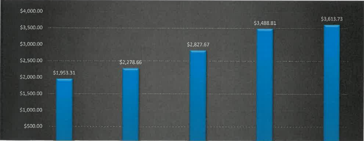
Township of Machar 2020 Total Annual Taxes beside 4 immediate comparators 2019 Total Annual Taxes.

Township of Machar 2020 Expenses 1 Council & Admin 2 By-Law, Fire, OPP 3 Transportation 4 Landfill & Recycling 5 Health & Social Services 6 Parks, Arena & Library 7 Planning & Prop Asmt 5 incl Health Unit, Ambulance, Cemeteries, DSSAB, Eastholme